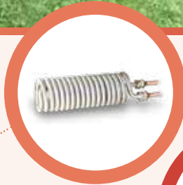
DOMESTIC HOT WATER INDUSTRIAL USE