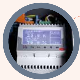
ELECTRONIC EXPANSION VALVE